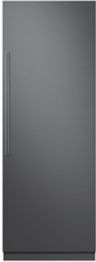
DRR30980RAP • $