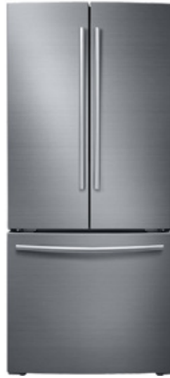
RF220NCTASR/AA • $$$