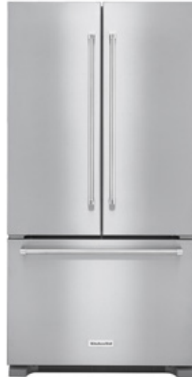
KRFC302ESS • $$

Strong, weight bearing doors can hold bulky items