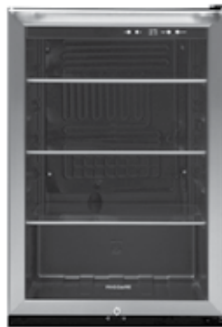
FFBC4622QS • $$