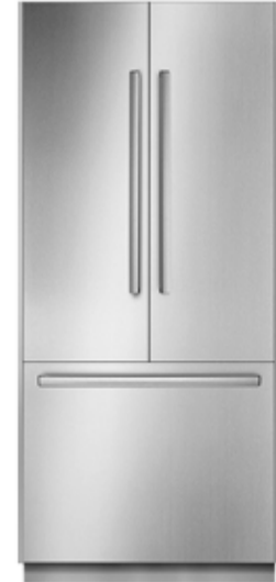
B36BT830NS • $$$

Humidity controlled crispers for balanced humidity