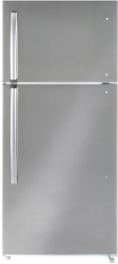
MTE18GSKSS • $