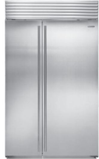
BI-48SID/O • $$$

SuperCool® technology lowers the refrigerator section to 35°F for 6 hours