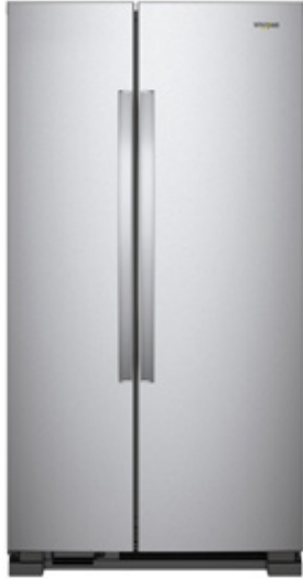
WRS312SNHM • $