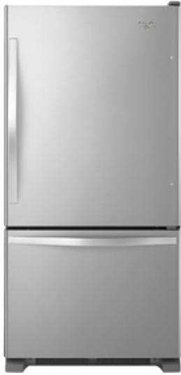
WRS312SNHM • $