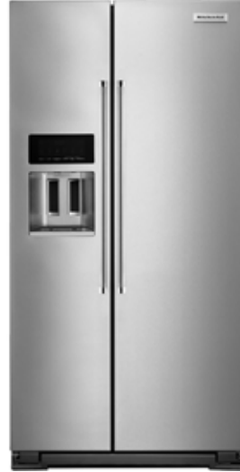
KRSC503ESS • $$