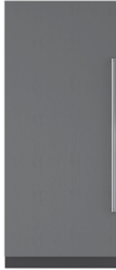
IC-36RID-RH • $$