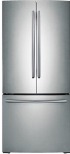
RF220NCTASR • $