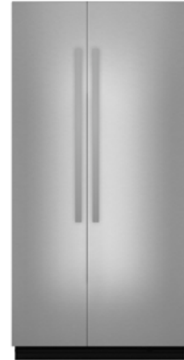
JS42NXFXDE • $$$