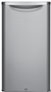
DAR033A6DDB • $