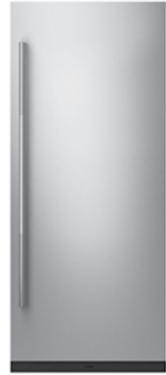
JBZFL24IGX • $$$