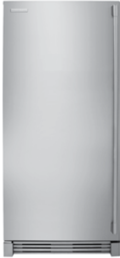
E32AR85PQS • $