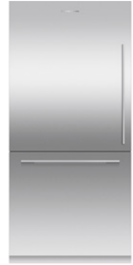
RS36W80LJ1N • $$$

Strong, weight bearing doors can hold bulky items