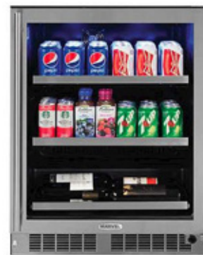
ND24BCG1RS • $$$