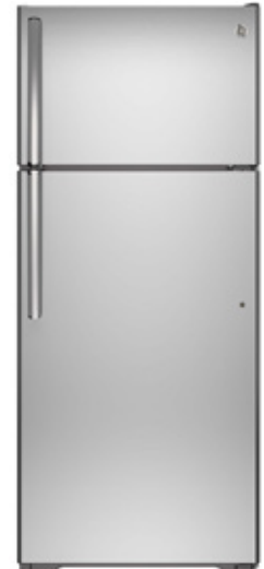
GTE18GSHSS • $$$