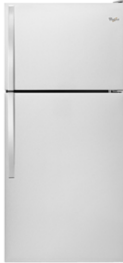
WRT318FZDM • $$